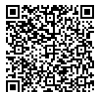
QR code RAC

Risk Analysis Consultants is a Czech based professional provider of information security services and solutions. We have assisted organizations from government and commercial sectors in protecting their information since 1995. We are the only firm exclusively specialized in the information security field in the Czech market, and one of the few in Europe and as well as the world.